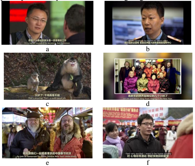
Figure 3. The participants

The participants in Figures 3a, 3b, 3f and 4 do not gate at the audience, thus, these images are "offer" images, providing information. For instance, Figure 3f portrays the couple's excitement of going home.