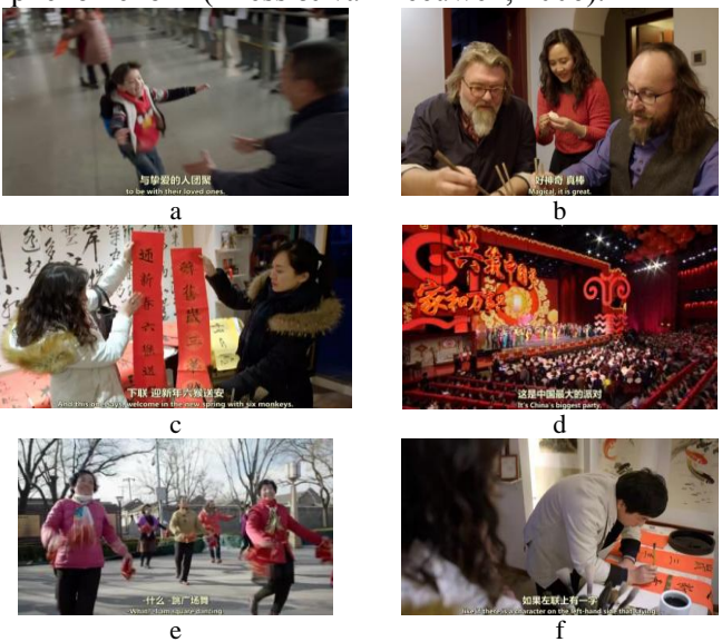
Figure 1. Action processes

van Leeuwen, 2006). In action process, there are two kinds of process, transactional process and non-transactional process. Transactional processes have both actors and goals, whereas non-transactional action processes do not have goals. In the reactional process, the vector is realized by an eye line or the direction of glance of one or more represented participants. The reactional process involves "reactor" and "phenomenon" (Kress & van Leeuwen, 2006).